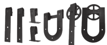
Seven Hanger Styles