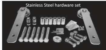
Stainless Steel hardware set

Our Stainless Steel Series offers a more elegant, modern style, with rounded corners on the roller hangers, round lag bolt cover caps, and a #4 brushed finish. Major components are made from solid stainless steel – not plated – for superior durability. Our stainless steel hardware can even be used in areas that are exposed to moisture.