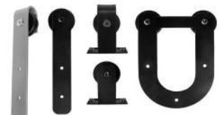
Five Hanger Styles