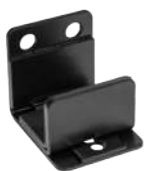
All-in-One Floor Guide

Goldberg Brothers offers a wide range of accessories to customize your barn door hardware installation. Many of them can be used with any sliding door, regardless of manufacturer. Ask your Goldberg Brothers dealer about these little extras that make a big impact.