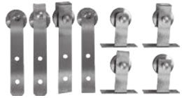
Eight Hanger Styles