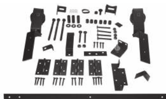
Barnfold® Series J-strap hardware set with track