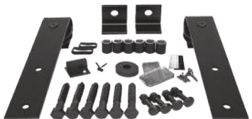
Standard Series J-strap hardware set

Our MP (Multi-Family Projects) Series barn door hardware is ideal for construction and remodeling projects in apartment complexes, hotels, and office buildings. It is an economical choice for medium-weight doors. Our CP (Consumer Pack) Series box sets contain custom curated MP Series J-strap hardware with track included, packaged and labeled for retail sale.